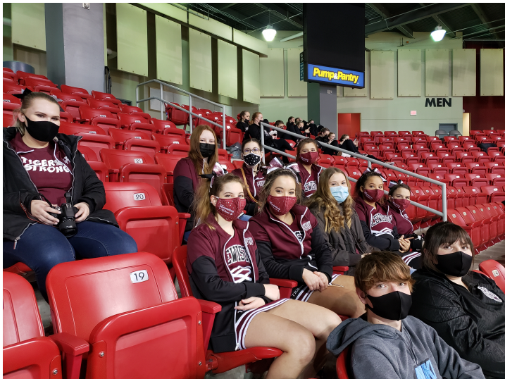
Cheer Squad at State